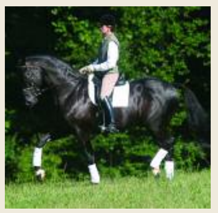
Riding half steps downhill helps Where's Waldo shift his weight, because he has to rock back and lift his forearms to stay balanced.