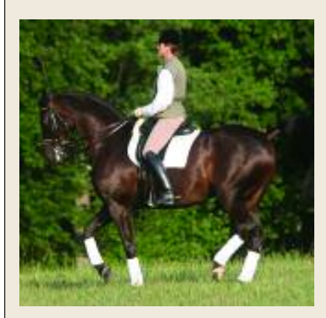
Roulette shows a new and improved balance in the piaffe.

make him wait on my seat as long as possible—not letting him go forward but letting him advance in the smallest trot strides. This develops a few steps of more extreme collection. This is called mobilizing the hindquarters and is one of the most important tools for training an upper-level horse.