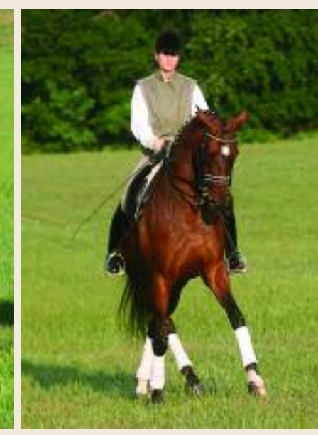
Graf Montekalino shows cadence and joint bending in shoulder-in (left) and maintains a steady rhythm and cadenced trot in half pass (right).