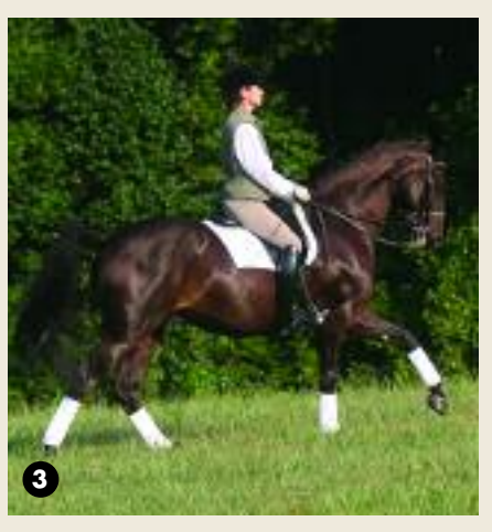
When riding flying changes uphill (1), the added challenge of continuously pushing against gravity (2) helps the horse jump through with height and expression (3). Roulette is a 1996 Oldenburg owned by Gene Freeze.

running away from your leg. The added challenge of continuously pushing against gravity breaks the cycle of heaviness in the connection.